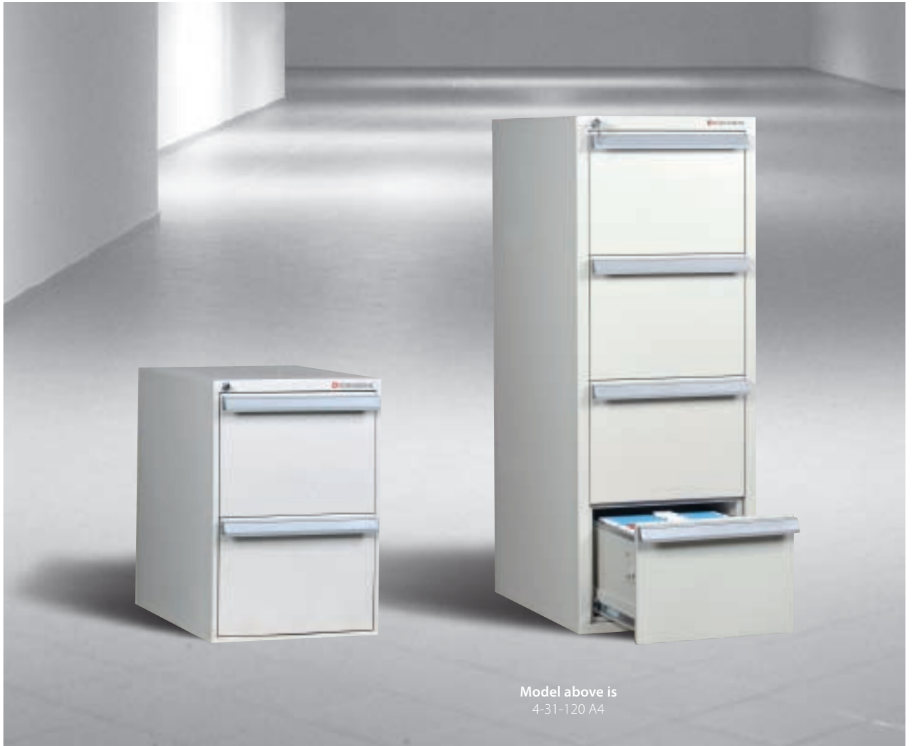
Model above is 4-31-120 A4