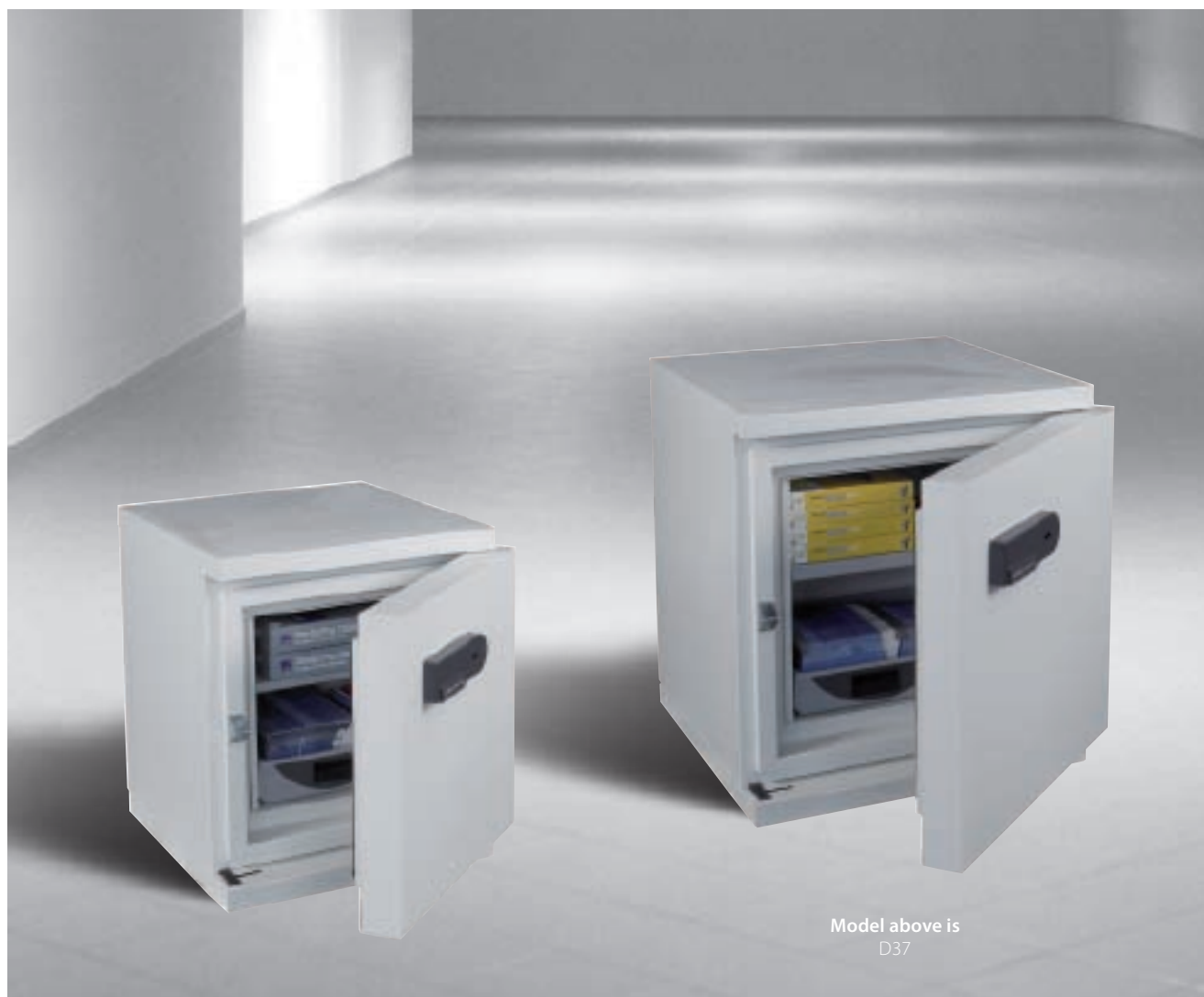
Model above is D37