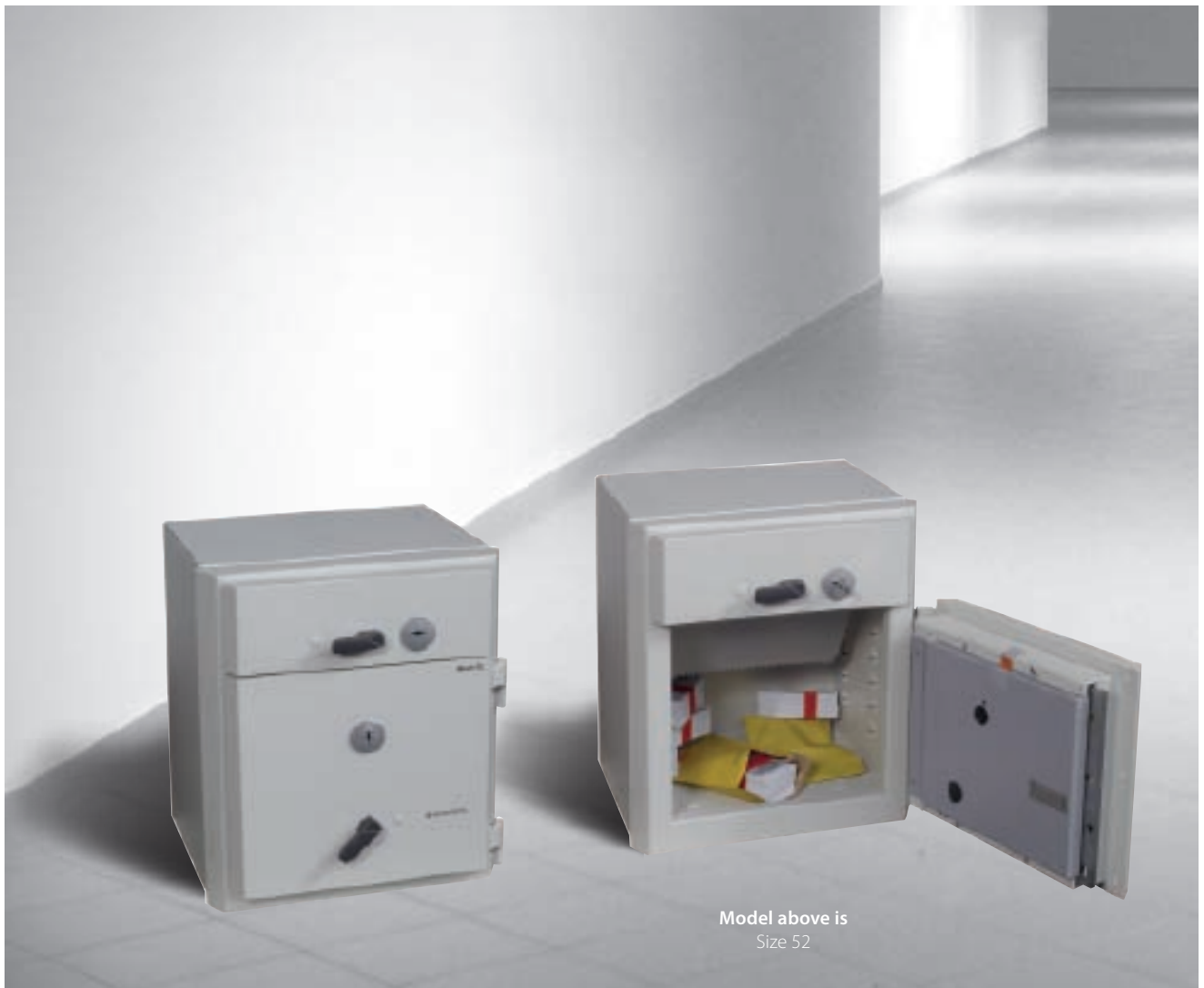
Model above is Size 52